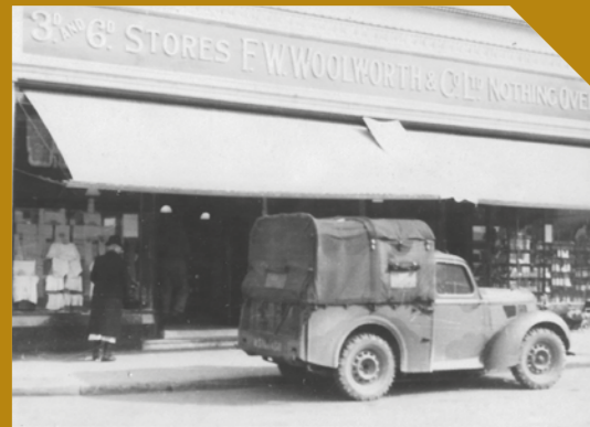
A common sight in Grantham during WWII