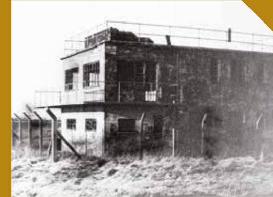
Fulbeck's former watch room