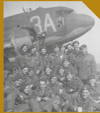
Awaiting their departure to infiltrate behind enemy lines at Arnhem are the paratroopers from the 1st Parachute Battalion.