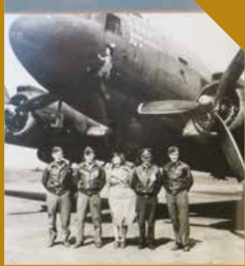
USAAF personnel at Saltby

www.aviationheritagelincolnshire.com www.ahleducation.org.uk www.visitlincolnshire.com/aviation/attractions.aspx www.heritageofflight.co.uk